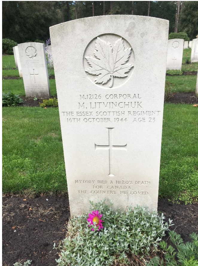
Figure 1 – Grave of Ukrainian Canadian soldier at Commonwealth Cemetery section at the Crooswijk General Cemetery in Rotterdam, Netherlands. One of approximately 50 Ukrainian Canadian soldiers buried there, who died fighting for the liberation of the Netherlands.