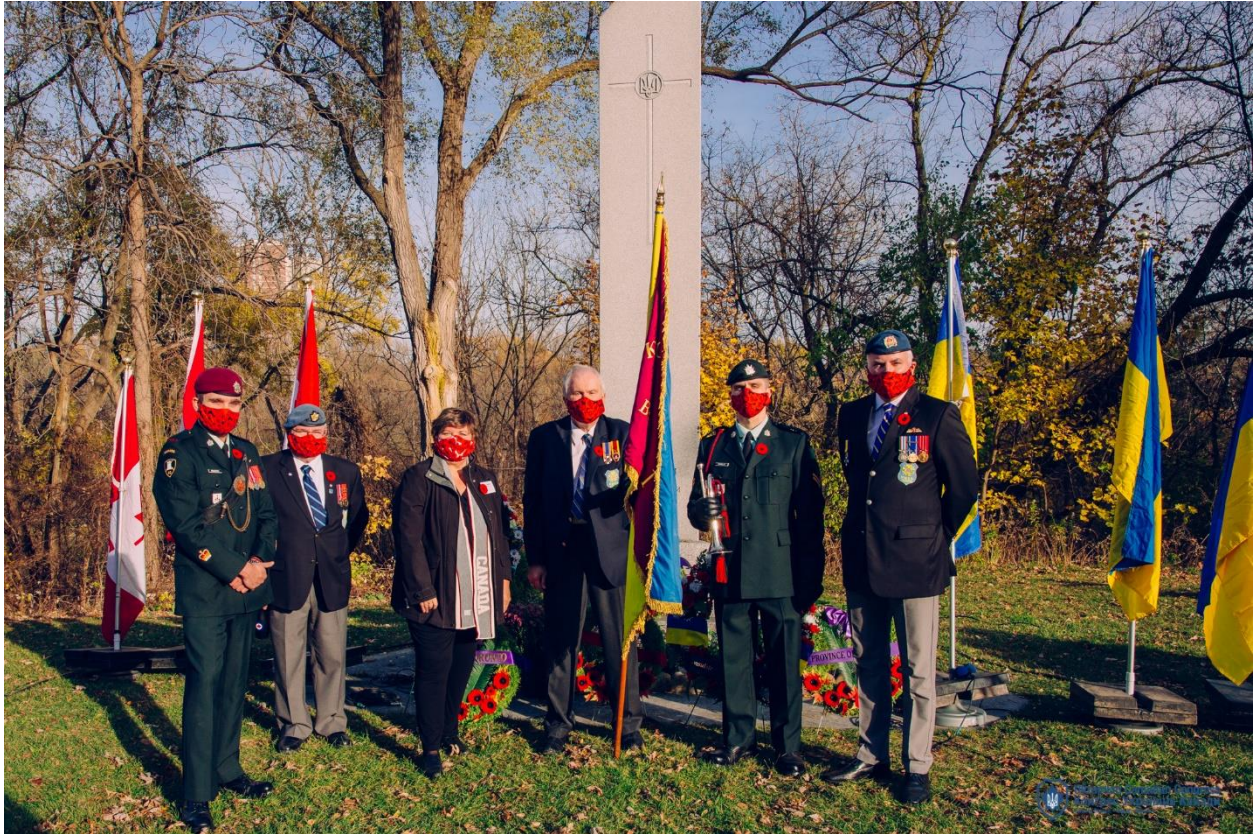
Figure 2 - Members of the Ukrainian War Veterans Association of Canada pose at the Ukrainian Canadian cenotaph at the Ukrainian Canadian Memorial Park in Toronto, ON on 7 November 2020.

War II, and proudly supported by the UWVA, entitled “A Canadian War Story”, was digitally screened across Canada. ( https://canadianwarstory.com/ )